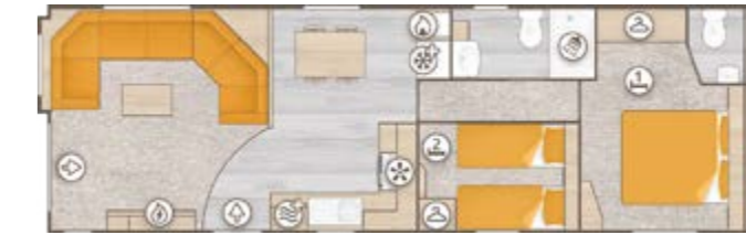
▲ BELMOR 36, 2 BEDROOMS