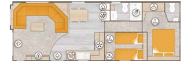
▲ BELMOR 33, 2 BEDROOMS