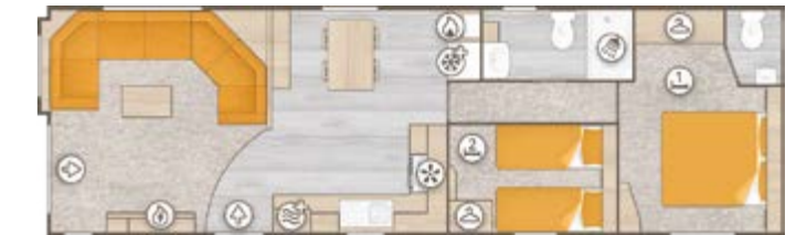
▲ BELMOR 38, 2 BEDROOMS