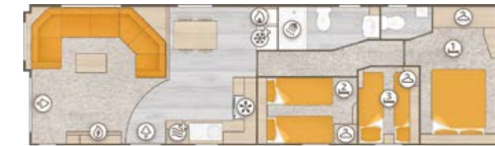
▲ BELMOR 39, 3 BEDROOMS